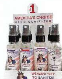
Spray Hand Sanitizer