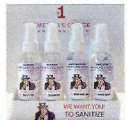
"Disaster Relief Pack"